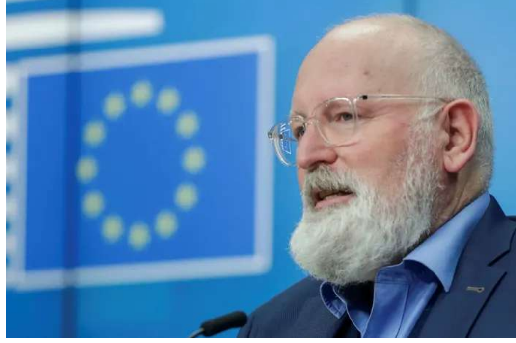
Frans Timmermans, executive vice-president for the EU's green deal, says the EU needs 'biomass in the mix' to meet its clean energy goals.

Timmermans himself has said that without biomass the EU will be unable to achieve its clean energy goals. "We need biomass in the mix, but we need the right biomass . . . I hate the images of whole forests being cut down to be put in an incinerator," <u>he told the Euractiv</u> website in May.