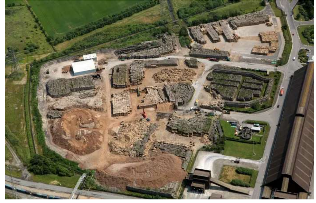
Drax power station in Yorkshire. The industry insists responsibly produced biomass is carbon neutral, as emissions from burning pellets are sucked up by regrowing trees